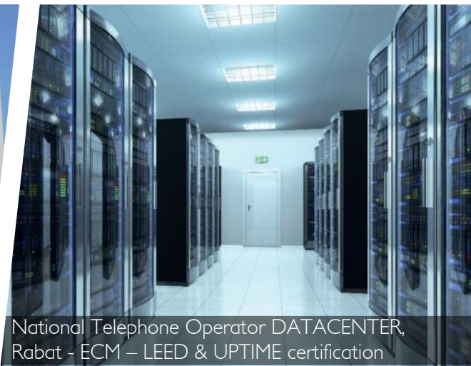
National Telephone Operator DATACENTER, Rabat - ECM – LEED & UPTIME certification