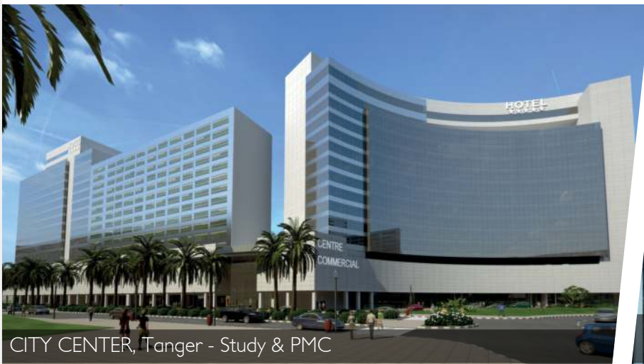
CITY CENTER, Tanger - Study & PMC