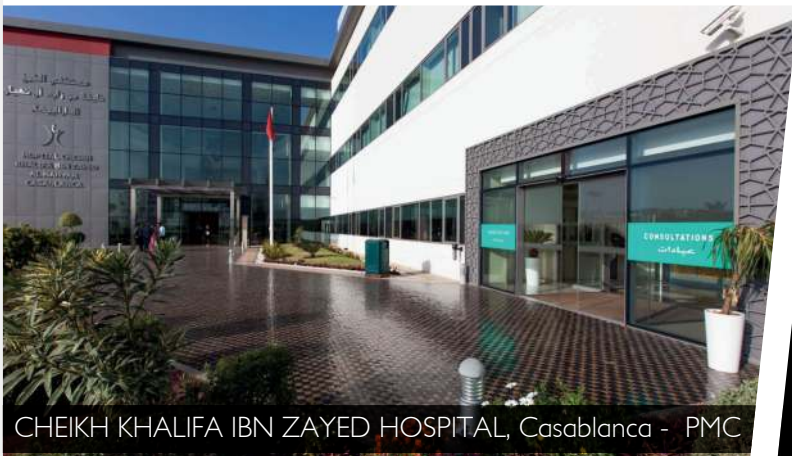
CHEIKH KHALIFA IBN ZAYED HOSPITAL, Casablanca - PMC