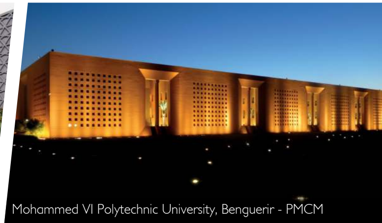
Mohammed VI Polytechnic University, Benguerir - PMCM